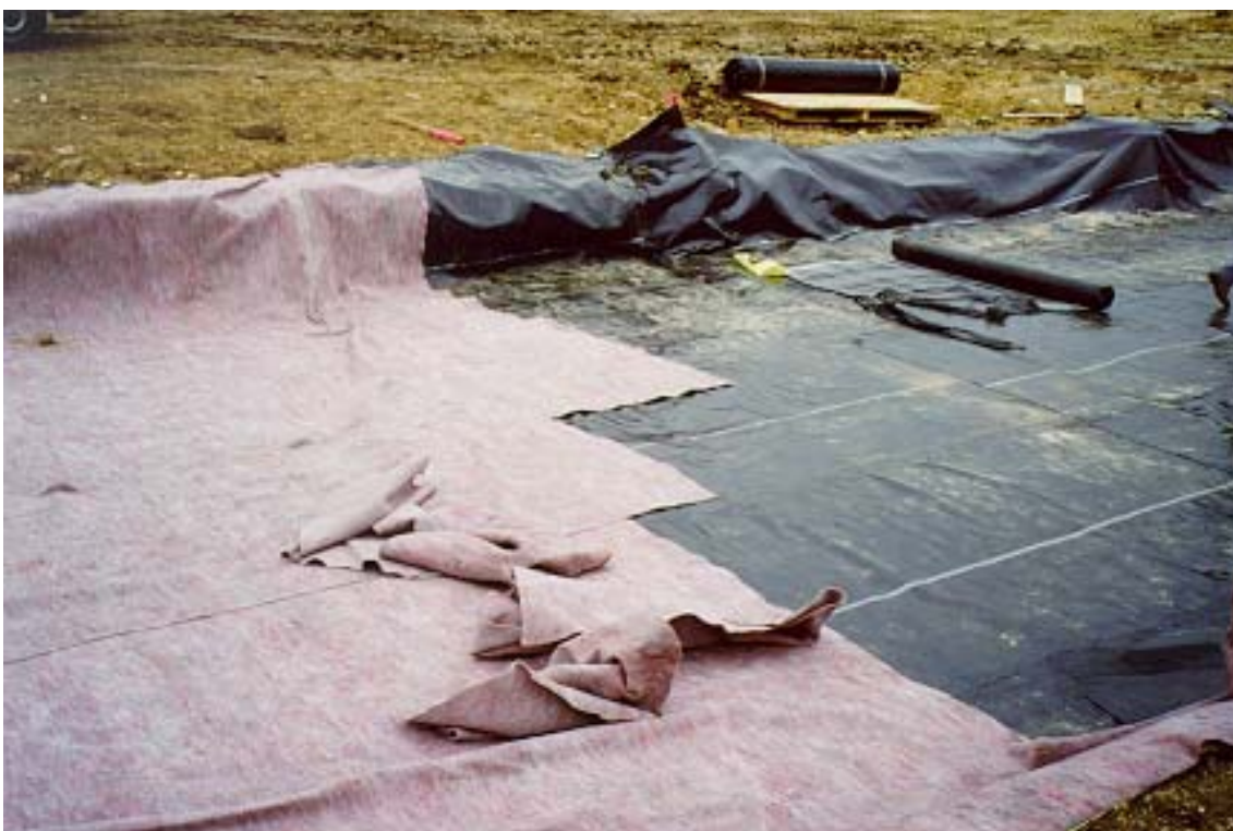
Figure 2 Géotextile de protection / Protective geotextile