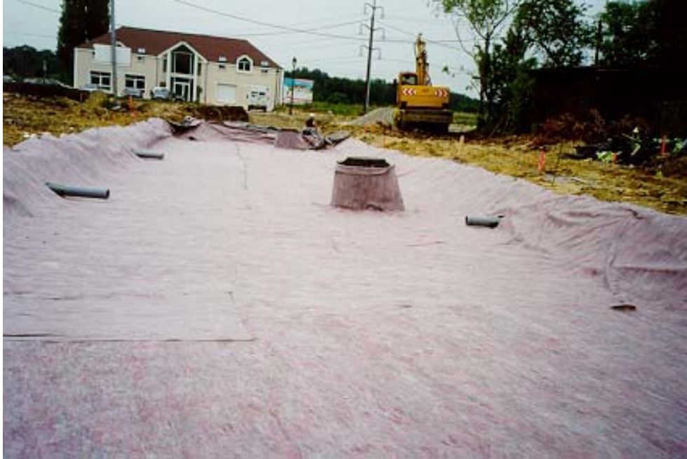
Figure 3 Vue d'ensemble d'un réservoir / General view of a reservoir