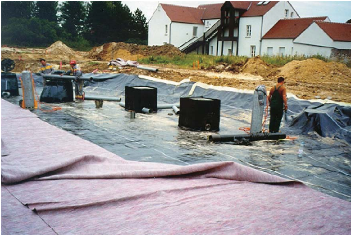
Vue d'ensemble / General view

Keywords: reservoir-pavement structure, geotextile, geomembrane, rainwater, drainage