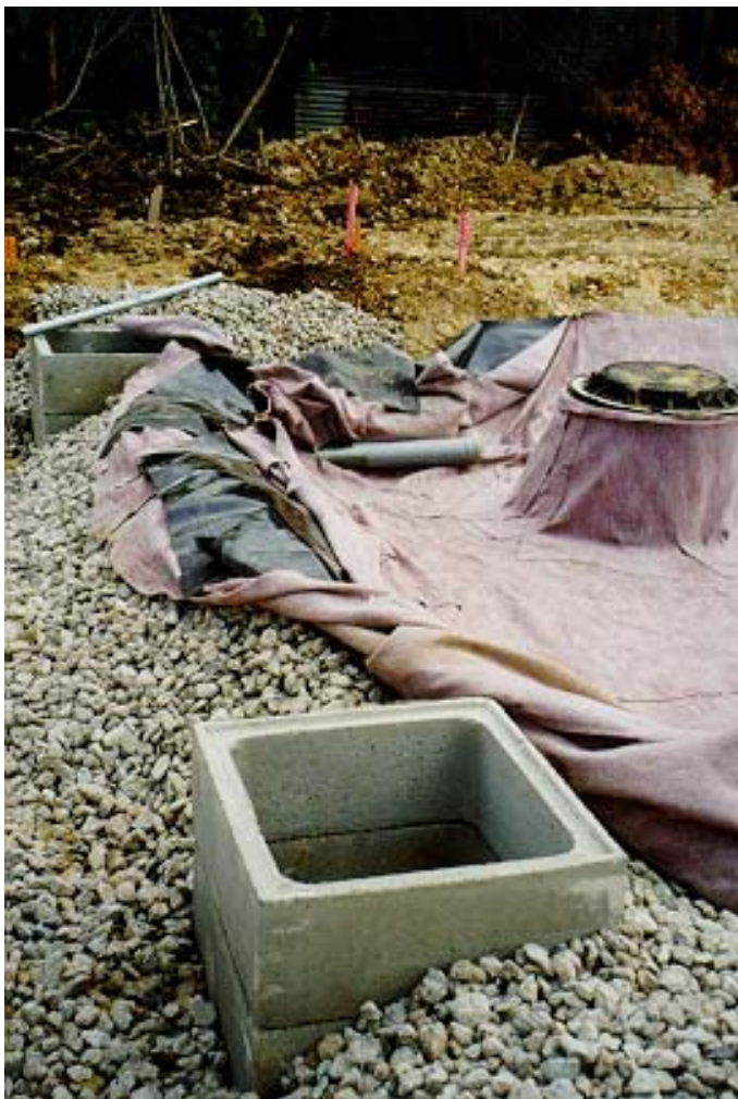
Figure 4 Cloison / Partition