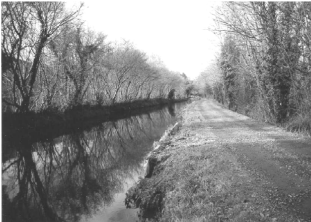
Figure 4: The old towpath and opposite bank showing tree growth.

In order to enable effective waterproofing of the uphill side of the canal bank, it was necessary to remove a number of small saplings and scrub bushes. The hedgerow was also thinned to allow more light and thus encourage reed growth, the preferred food of Water Voles. Figure 4, below, shows the appearance of the bank beforehand. The old towpath and absence of retaining wall are also clear in this picture.