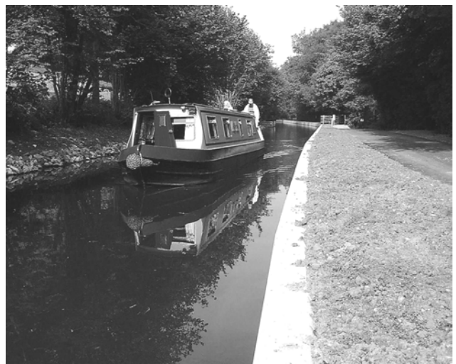
Figure 9: The completed canal, opened to holiday traffic

Following completion, the canal was refilled and opened up and returned to its normal use for the holiday season (figure 9).