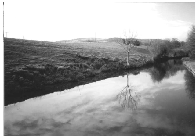
Figure 2: Access to canal from pasture (before work commenced)

The work involved dewatering the section of canal to be repaired and forming an access point for construction plant and materials from the pasture above the canal into the canal bed (figure 1). As the Llangollen canal forms part of the important local water resource, pumps were installed to maintain the flow of water and by-pass the closed off section whilst work was in progress.