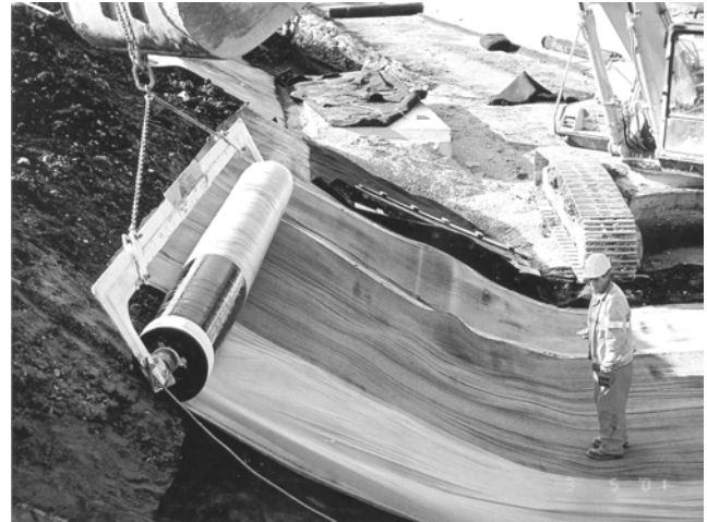
Figure 5: Unrolling the geomembrane

The rolls of geomembrane were transported along the bed of the canal by the use of a 30-tonne 360°-tracked excavator. A purpose-designed beam for unrolling the material was used; this allowed the heavy rolls to be maneuvered and the liner placed in position across the bed of the canal (see figure 5).