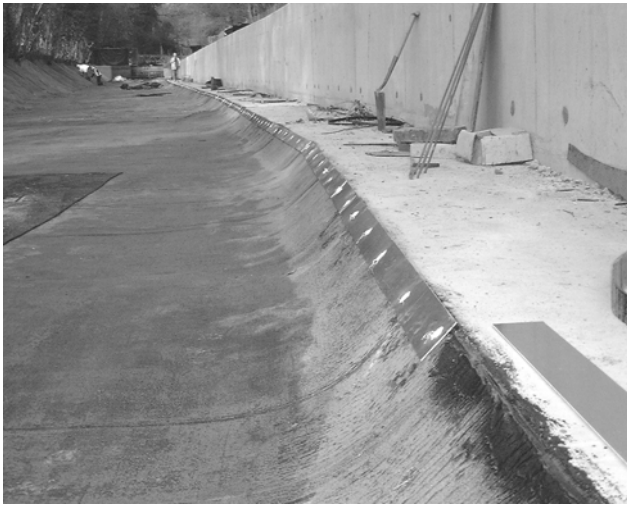
Figure 7: The geomembrane bonded to wall and reinforced

Additionally it is usual, when bonding the material to concrete structures, to reinforce the welds with a strip of aluminium or stainless steel approximately 2mm thick. This is designed to prevent the possibility of the edge of the liner becoming damaged and peeling back after time. In this case it was Hilti-Nailed to the concrete, and provides extra security for the edge at little cost (figure 7).