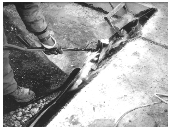
Figure 6: Bonding to the concrete wall

The simplicity and effectiveness of the welding method for this type of liner are a major benefit on sites such as this. The edge of each roll of liner has a 200mm strip of kraft paper incorporated along the length, which is peeled off to expose a clean edge. This edge is lifted slightly, and a propane gas torch used to heat and liquefy the bitumen. The two layers are then brought together and rolled with a light hand held roller to produce a continuous seam. The very edge is then heated and trowelled over to remove any possibility of failure. Concrete structures are treated similarly, having been previously primed (see 6.2).