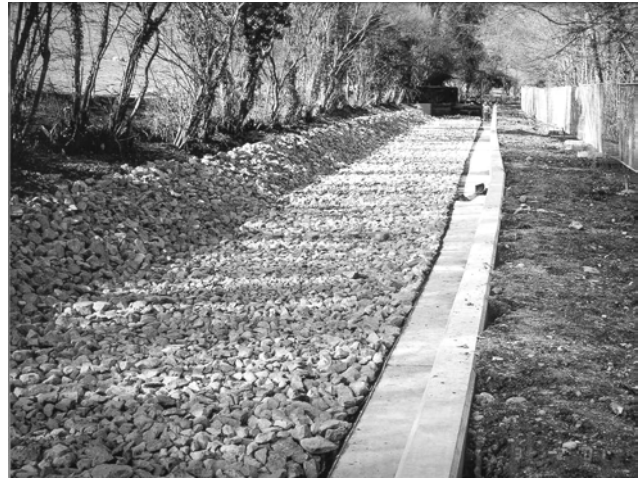
Figure 8: The rip-rap placed along the bed and up the bank

The liner was covered firstly with a geotextile protection blanket (see 6.3), and then 100mm of type 1 crushed stone. This was leveled out with an excavator as it progressed along the bed. Following this operation nominal 150-200mm diameter rip-rap stone was placed along the bed of the canal and up the bank in order to provide additional protection for the liner and, equally important, provide an aquatic habitat for water-living creatures. The completed canal bed is shown in figure 8.